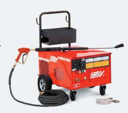
Model 1720 shown with optional wheel kit